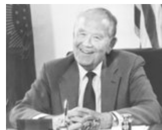
Quentin N. Burdick