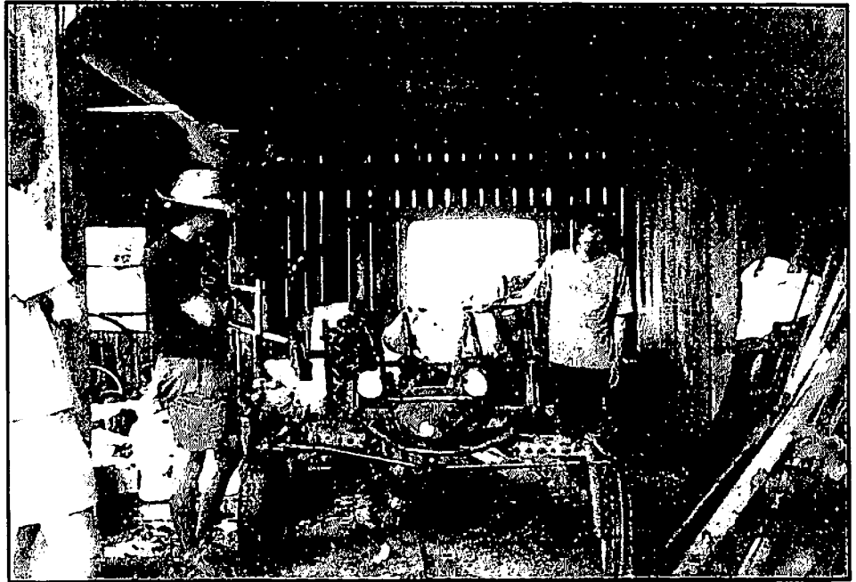
Problem solving at ISE: can this old vehicle be usefully recycled?

For those who want an immersion experience,