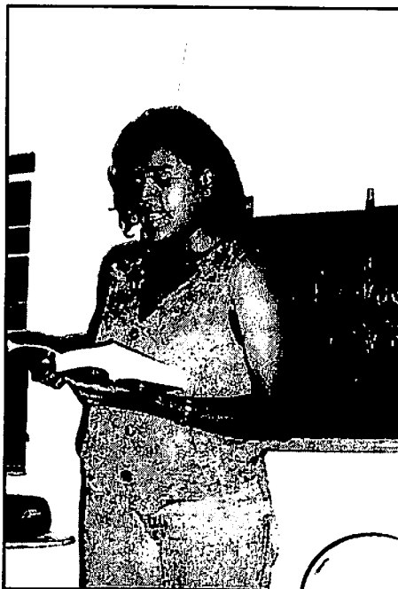
"At the Institute"

Importantly, the kinds of solutions ISE promotes are those come to by many GEO reader-activists, armchair and otherwise: "humanly scaled, decentralized, democratic communities." In addition to providing formal and informal classes and degree programs, demonstration projects in ecological building, permaculture, and community planning, and promoting the movement and philosophy of social ecology, ISE has on many occasions provided "technical assistance and program planning assistance in the development of alternative cooperative structures such as community supported agriculture projects, community currency projects, food coops, low income housing cooperatives, and community gardens" ( Social Ecology News , Autumn 1998, p. 2). These are of course the kinds of projects many GEO readers give their hearts and souls to.