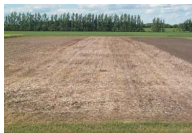
Tillage treatments in the cropping system, (left to right) minimum tillage, no-till, and conventional tillage.