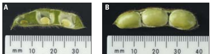
Figure 5. Soybean growth stages – A) Beginning seed (R5) – seeds are at least one-eighth-inch long in a pod from one of the top four nodes of the plant. The soybean aphid threshold applies through R5. B) Full seed (R6) – a pod on any of the top four nodes has seeds that fill the pod to capacity. By R6, there is no reliable yield gain from insecticide treatment. For more information about soybean growth stages, visit http://extension.agron.iastate.edu/soybean/production_growthstages.html .