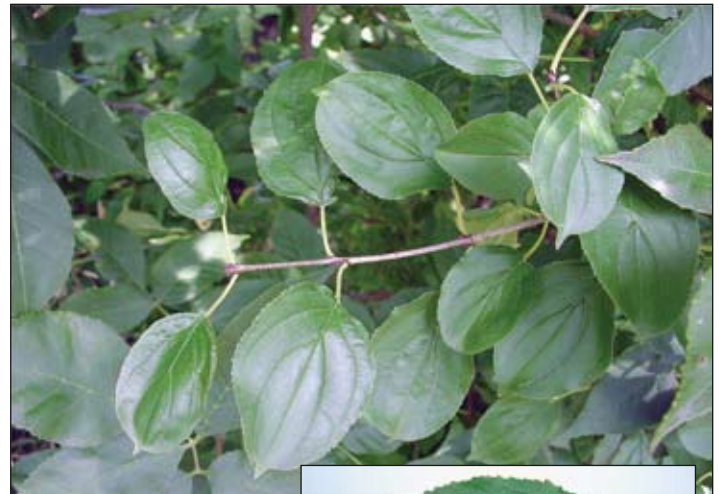
Figure 3. Common buckthorn ( Rhamnus cathartica )—leaves have toothed edges and curved veins. Dark berries may be present in the fall.

When scouting for soybean aphids, walk a broad U or X pattern through the field and examine 20 to 30 plants total, spread out over the field. Aphids can occur in “hot spots,” so it’s important not to make your decision based on just one spot that doesn’t represent the field as a whole. Pick a plant at random and count aphids, starting at the bottom and working your way up. Soybean aphids don’t drop off easily, so you can pull the plant up for easier examination if you choose. Pay special attention to the undersides of the leaves and the newest vegetation. Early in the season, aphids tend to occur on the newest vegetation at the top of the plant. Late in the season, they are often concentrated