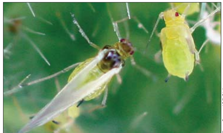
Figure 4. Winged and wingless morphs

© Chris Even, River to River CWMA, Bugwood.org Kelley Tilmon (SDSU)