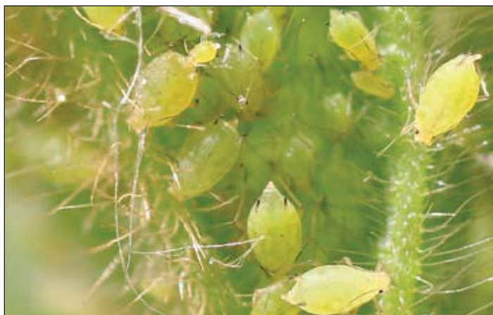
Figure 2. Aphids range from yellow to pale green. Dark-tipped cornicles ("tailpipes") are found on the abdomens of adults. Note the female in the upper left giving live birth to another female.

The soybean aphid, like many aphid species, has a complex life cycle that involves different morphs (body types) and two host plant species. Through most of their life cycle soybean aphids are parthenogenic, meaning that they don't need to mate to reproduce. All the aphids are female, and they give live birth to all-female offspring that are themselves only days away from being able to reproduce. These features give soybean aphids the ability to increase very rapidly when conditions are right.