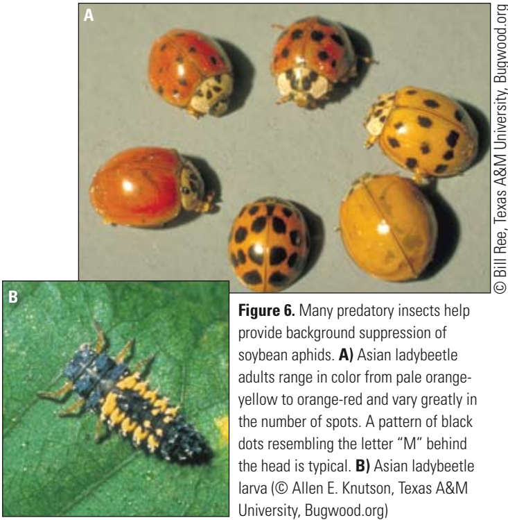
Figure 6. Many predatory insects help provide background suppression of soybean aphids. A) Asian ladybeetle adults range in color from pale orange-yellow to orange-red and vary greatly in the number of spots. A pattern of black dots resembling the letter “M” behind the head is typical. B) Asian ladybeetle larva