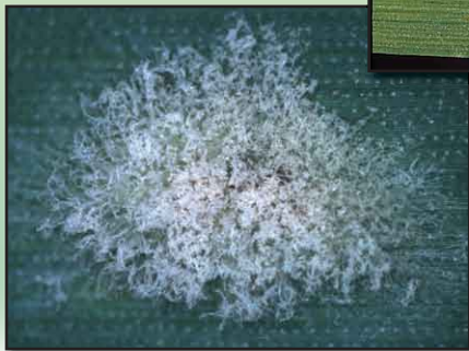
Close-up of spore masses